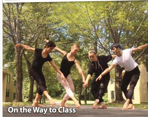
On the Way to Class