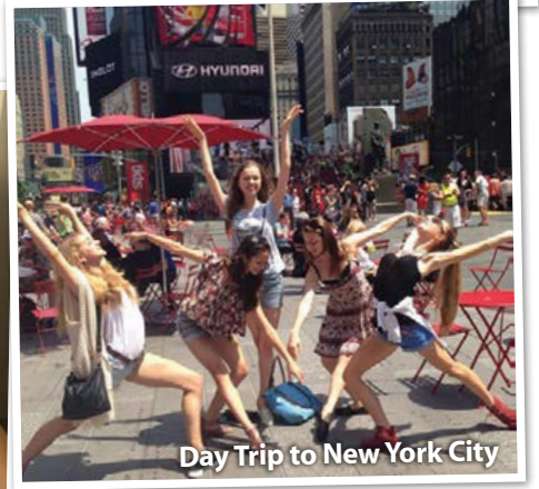
Day Trip to New York City