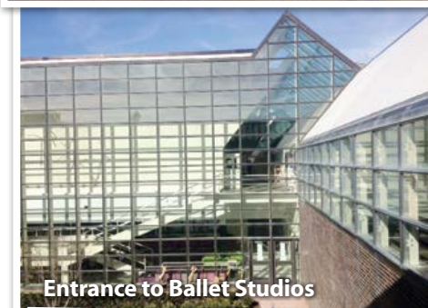
Entrance to Ballet Studios