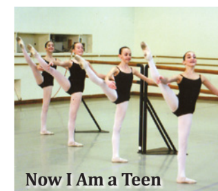
Now I Am a Teen