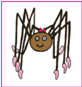
Terri the Tarantula