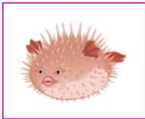
Betty the Blowfish