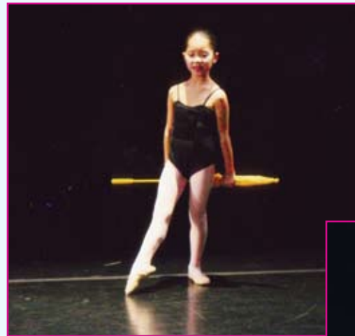
Performance Awards Level 3

For further information about this unique program, please call, write, or fax the office. (See contact information on the back page of this brochure).