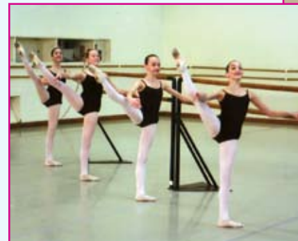
Now I Am a Teen