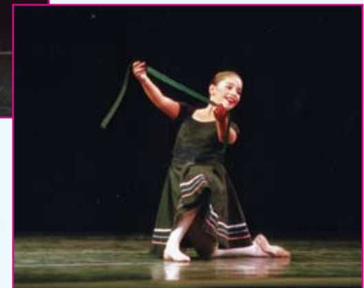
Performance Awards Level 3