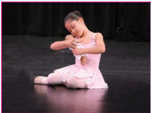
Performance Awards Level 1

Every student has the opportunity to dance in pairs and in a solo before an audience. The awarding of medals and certificates to EACH student does wonders for their self-esteem and determination to achieve personal best.